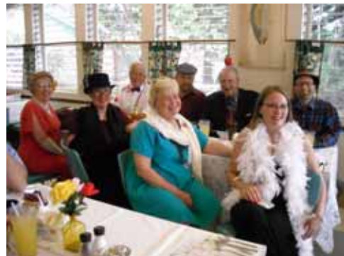
"Murder at Watersdown Mansion" cast at Hana Hou Restaurant.